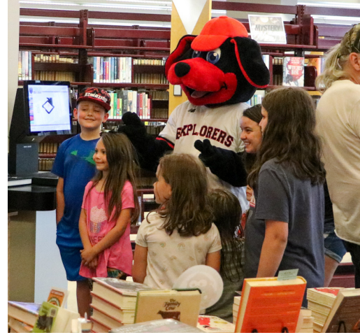
(Above) Kickoff attendees take photos with Slider, the Sioux City Explorers mascot. (Below) Children two and under enjoyed a special storytime.

Minutes read by Sioux City Public Library Summer Reading Participants!