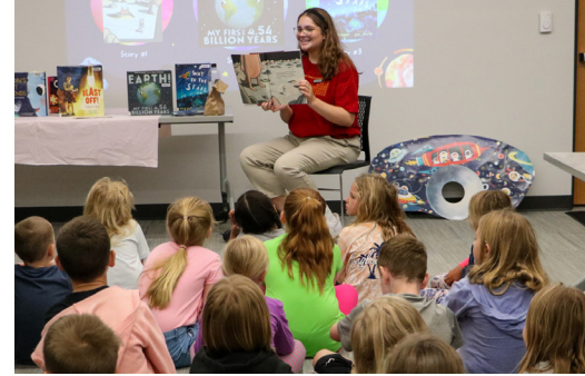
Imagination Builders, ages 6-8, listen to a story.