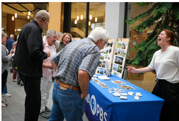
Attendees view photos at PBS's Iconic Iowa Photo event.