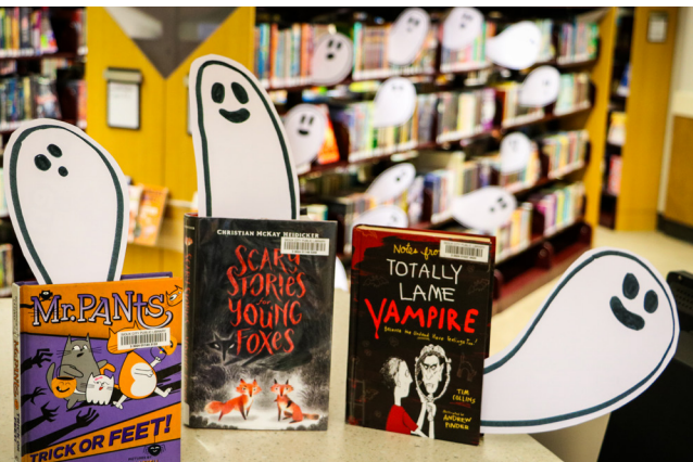
During October, ghosts haunted the Juvenile Fiction section.