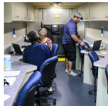
The Goodwill Career Cruiser helps find employment.