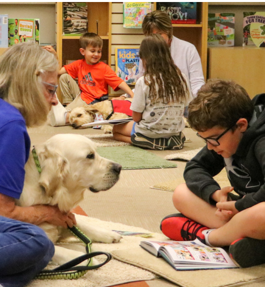
Therapy dogs were comforting listeners for hundreds of kids at Read-to-Me-Dogs events at AalFs Downtown Library.