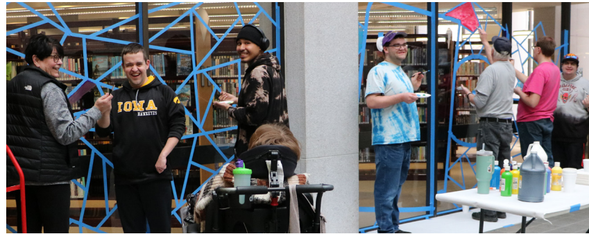
Over 50 people participated in creating a mural for Sioux City Reads.

Over 300 people participated in Sioux City Reads events and activities.