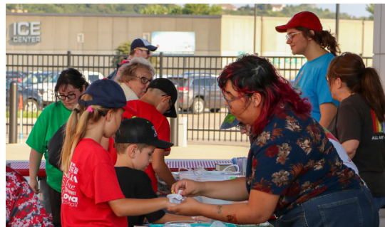
The Library partnered with the Sioux City Explorers. Players attended the Kickoff, and a special Explorers game night was offered as a reward for youth who met Summer Reading goals.