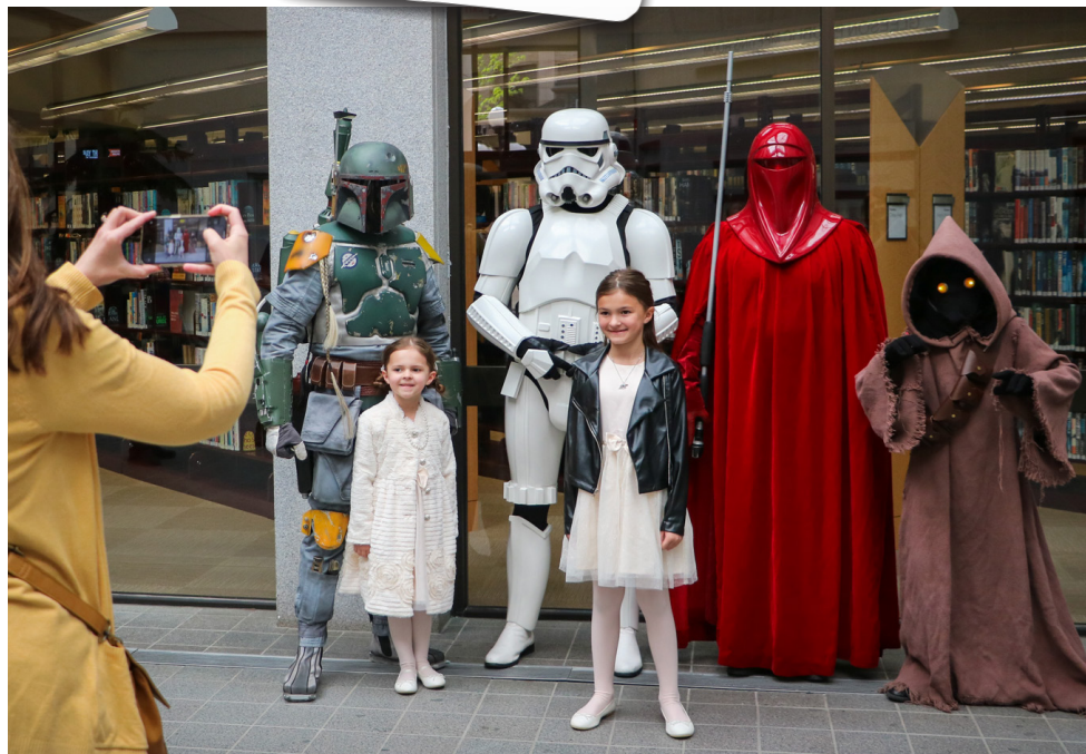
The Library partnered with the 501st Legion to bring a special surprise during the First Saturday Family Storytime: May the Fourth Be With You event.