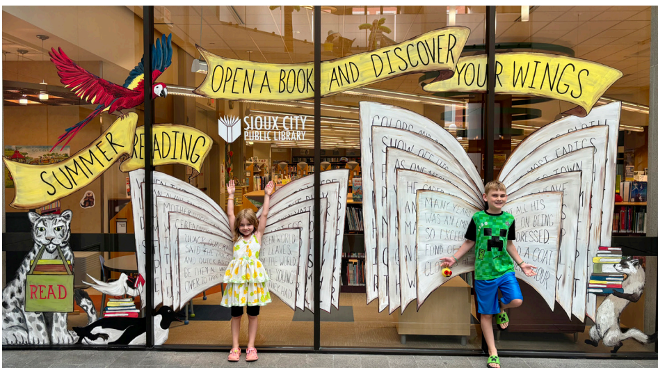
Windows at all Library locations were painted to celebrate Summer Reading. The above windows at Aalfs Downtown Library provided an interactive photo opportunity for Library visitors to capture memories.