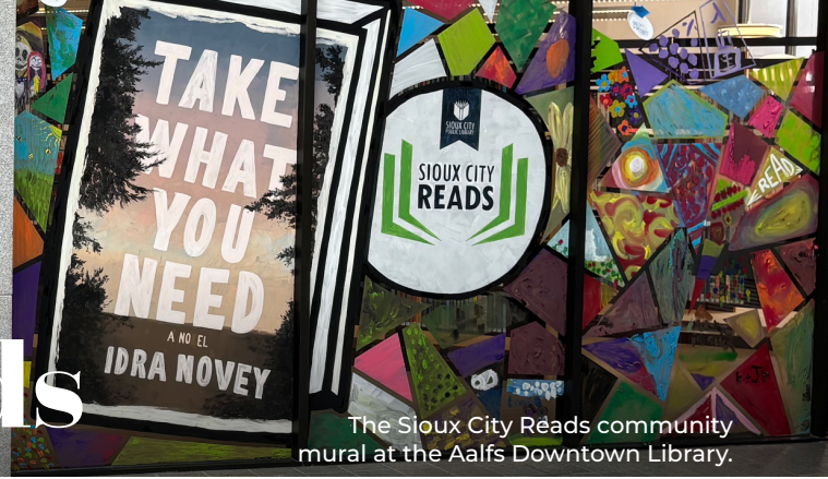
The Sioux City Reads community mural at the Aalfs Downtown Library.

In FY24, Sioux City Public Library held its 2nd Sioux City Reads season. Sioux City Reads is a community-based reading initiative where Sioux Cityans were involved in every step – from book selection, to programming and book discussions.