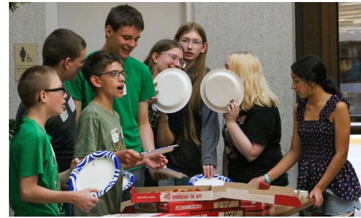
Over 50 teens participated in the Teen After-Hours: Mystery at Camp Harmony Hollow event.